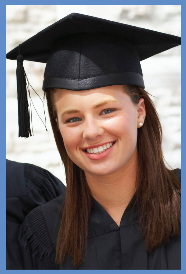
Making college affordable