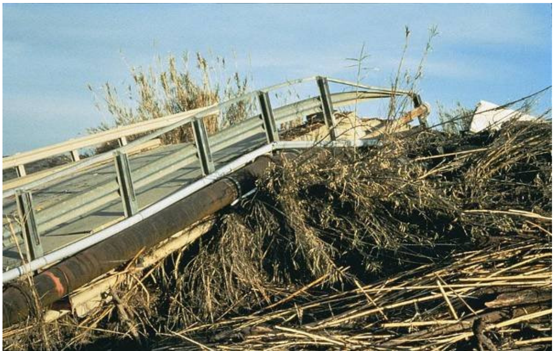
Figure 2, Bridge damage from Arundo dam (Photo from Ref-02)