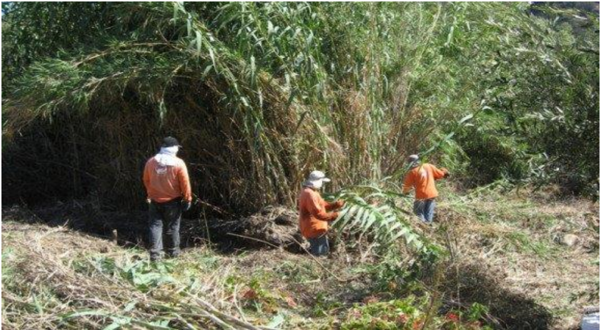
Figure 01, Arundo growth.

Uprooted vegetation and debris can and has caused major damage to infrastructure and private property. Therefore, this investigation focused on the ability of the County to manage/eradicate Arundo in the riverbeds.