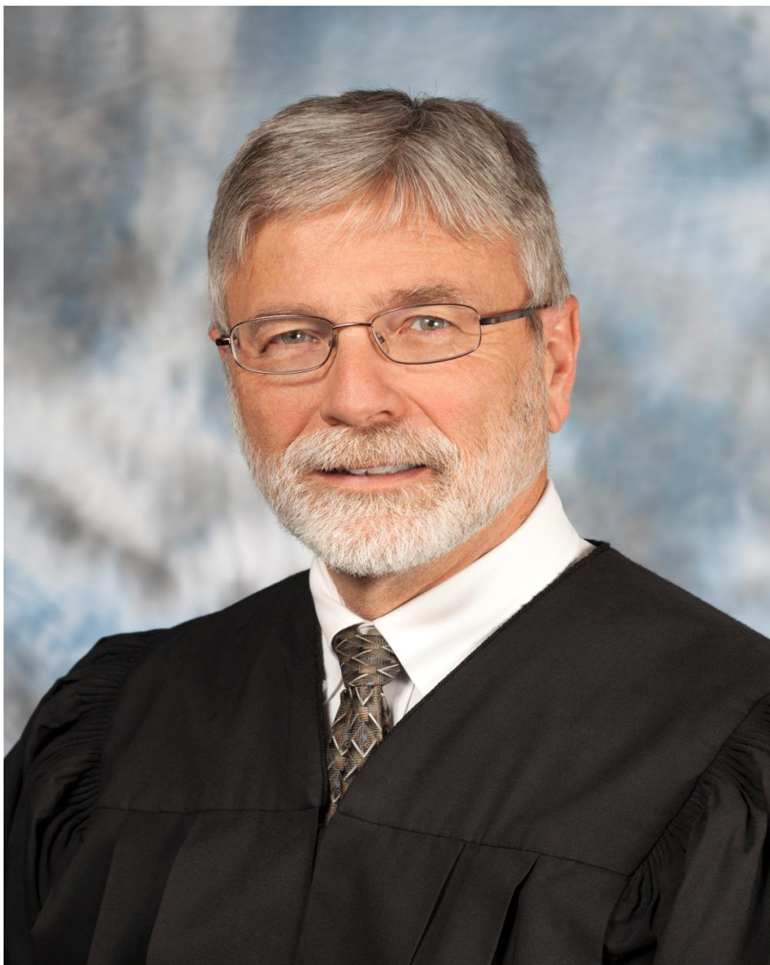
Brian J. Back Presiding Judge of the Superior Court January 1, 2013 – December 31, 2014