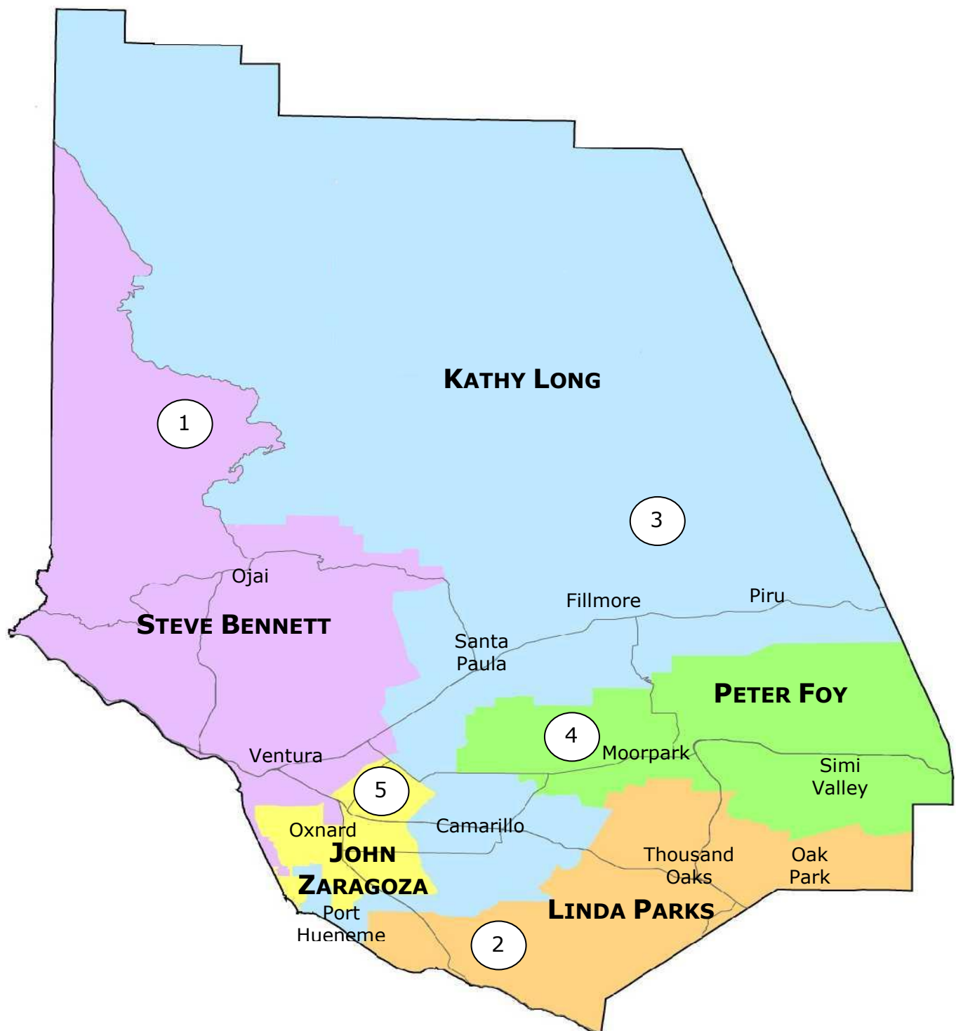
Supervisorial Districts in Ventura County