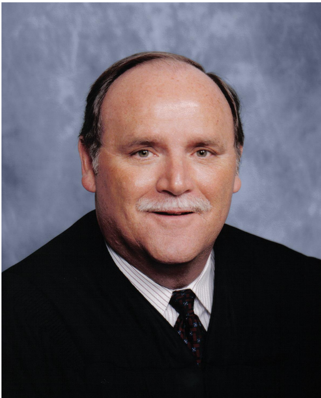
Donald D. Coleman Presiding Judge of the Superior Court January 1, 2015 – Present