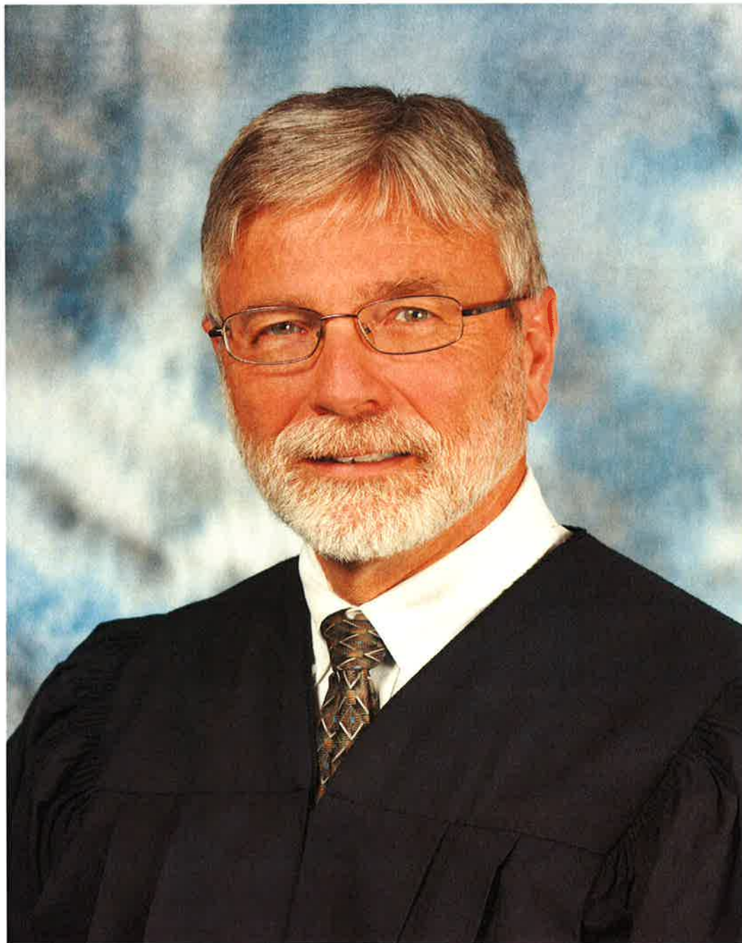
Brian J. Back Presiding Judge of the Superior Court January 1, 2013 – Present