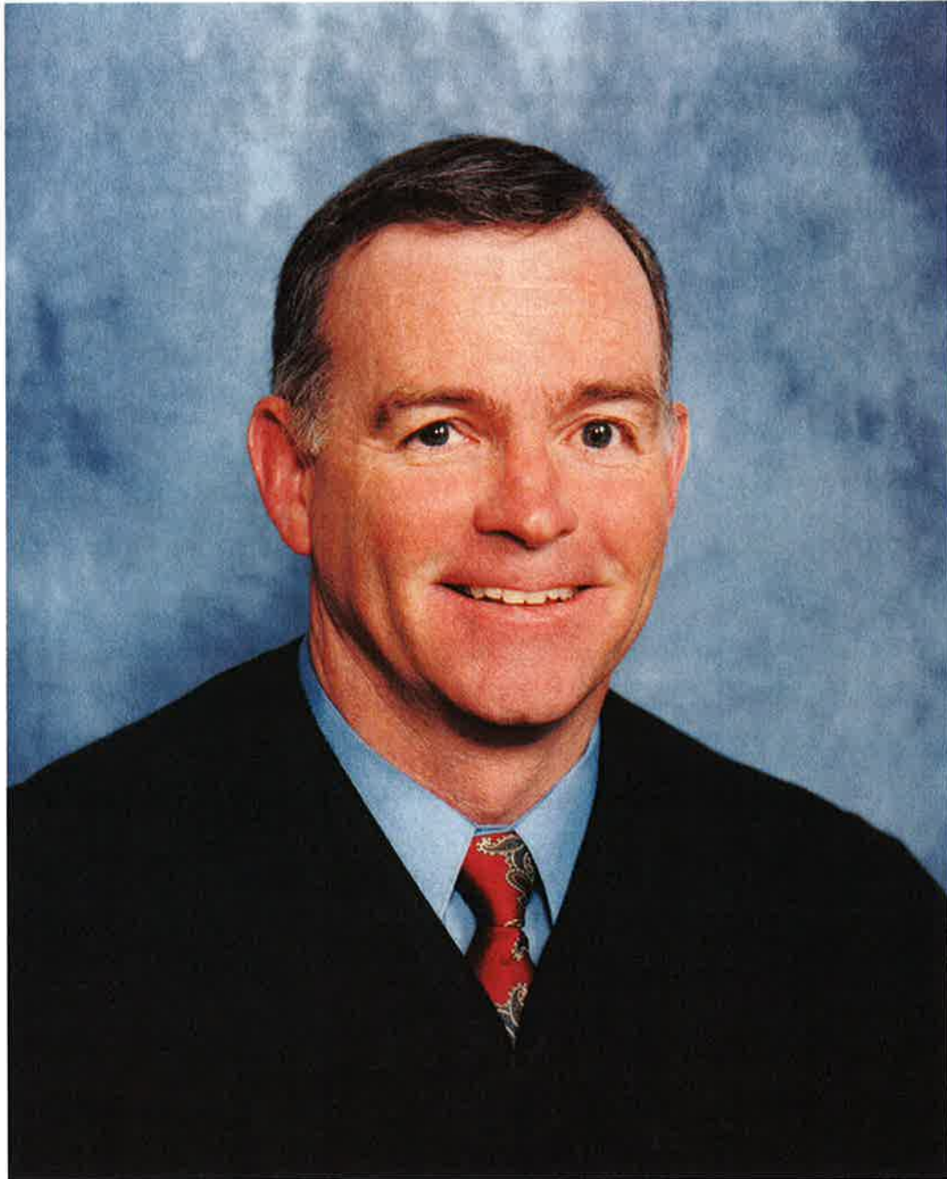
Vincent J. O'Neill, Jr. Presiding Judge of the Superior Court January 1, 2011 – December 31, 2012