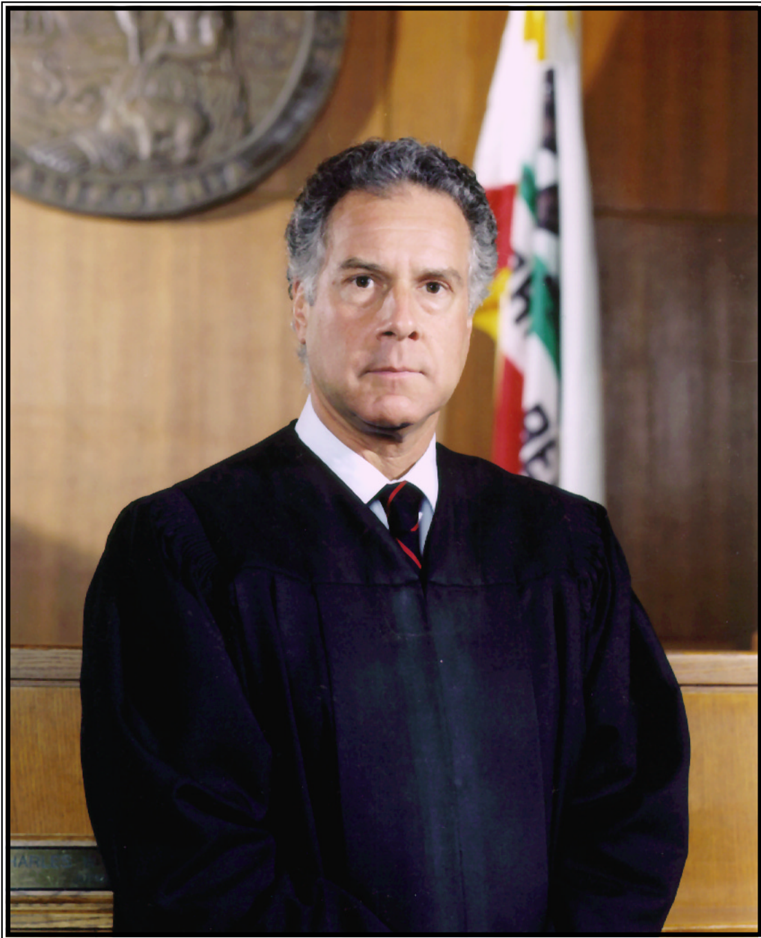
CHARLES W. CAMPBELL Presiding Judge of the Superior Court January 1, 1998 - December 31, 2000