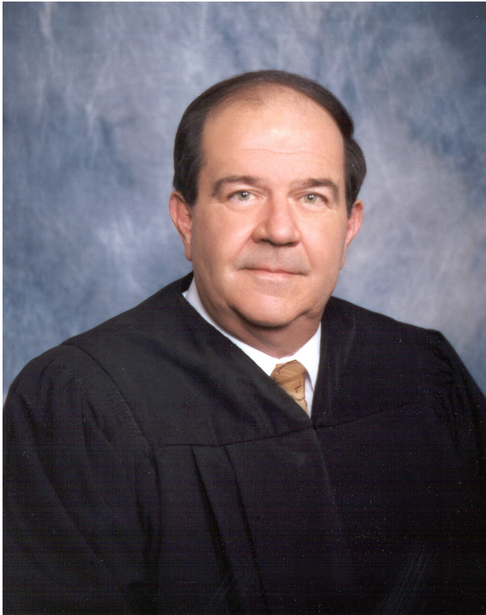
BRUCE A. CLARK Presiding Judge of the Superior Court January 1, 2001 - present