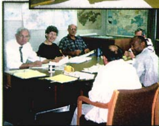
1998 Grand Jury at work