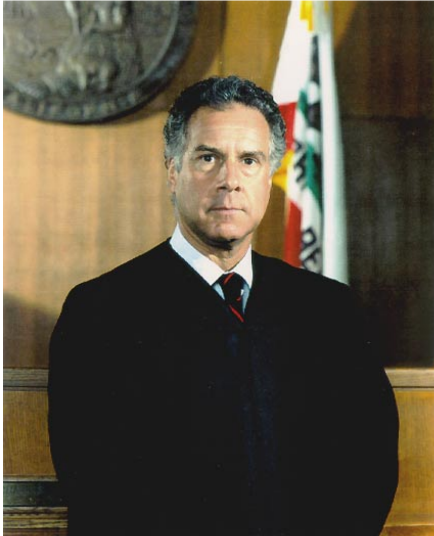
CHARLES W. CAMPBELL Presiding Judge of the Superior Court