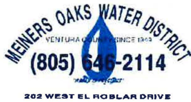
EXHIBIT A – DESIGNATED POSITIONS AND FILING OFFICERS