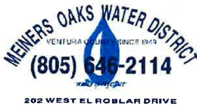
EXHIBIT B – DISCLOSURE CATEGORIES

The terms italicized below have specific meanings under the Political Reform Act. In addition, the financial interests of a spouse, domestic partner, and dependent children of the public official holding the designated position may require reporting. Consult the instructions and reference pamphlet of Form 700 for an explanation.