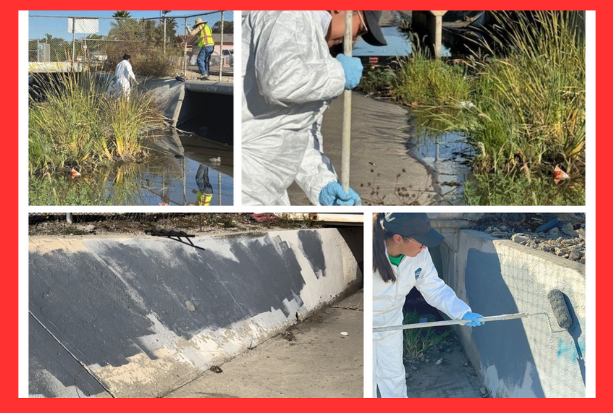
Removing Graffiti at J St Canal

After my office received complaints, on December 14th, in partnership with our Ventura County Public Works Department, we were up bright and early to remove over a mile worth of graffiti in the J St Canal. If you see any graffiti in a watershed canal, you can report it on the Public Works Report a Concern tool which you can see here