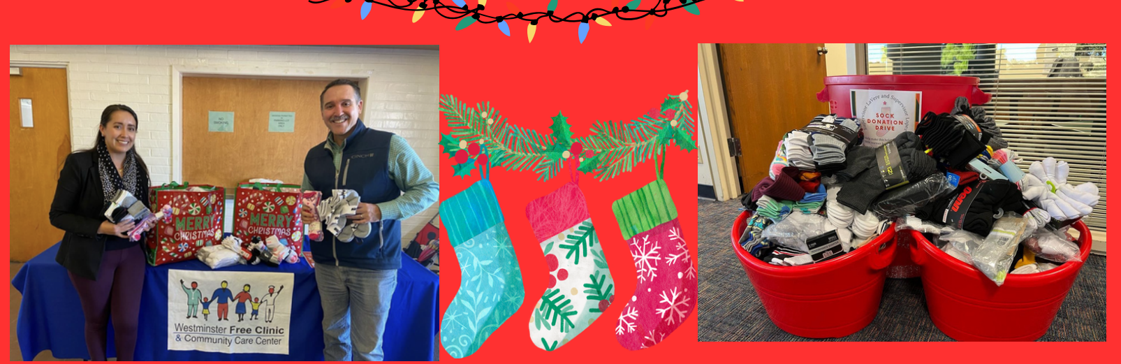
Holiday Sock Drive

After my office received complaints, on December 14th, in partnership with our Ventura County Public Works Department, we were up bright and early to remove over a mile worth of graffiti in the J St Canal. If you see any graffiti in a watershed canal, you can report it on the Public Works Report a Concern tool which you can see here