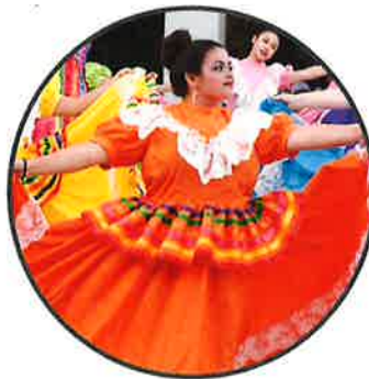
Live Music & Dance