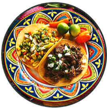
Food & Drinks From South of the Border