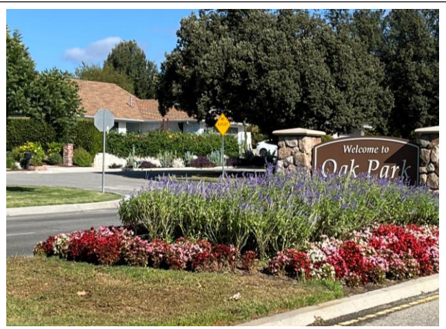
Annual color at Kanan monument near Conifer is growing well and will need replacement soon.