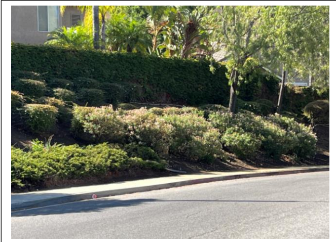
Parkway landscape along Hawthorne near Kanan clean along slopes.