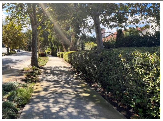
Parkway along Kanan near Bowfield clean along sidewalks.