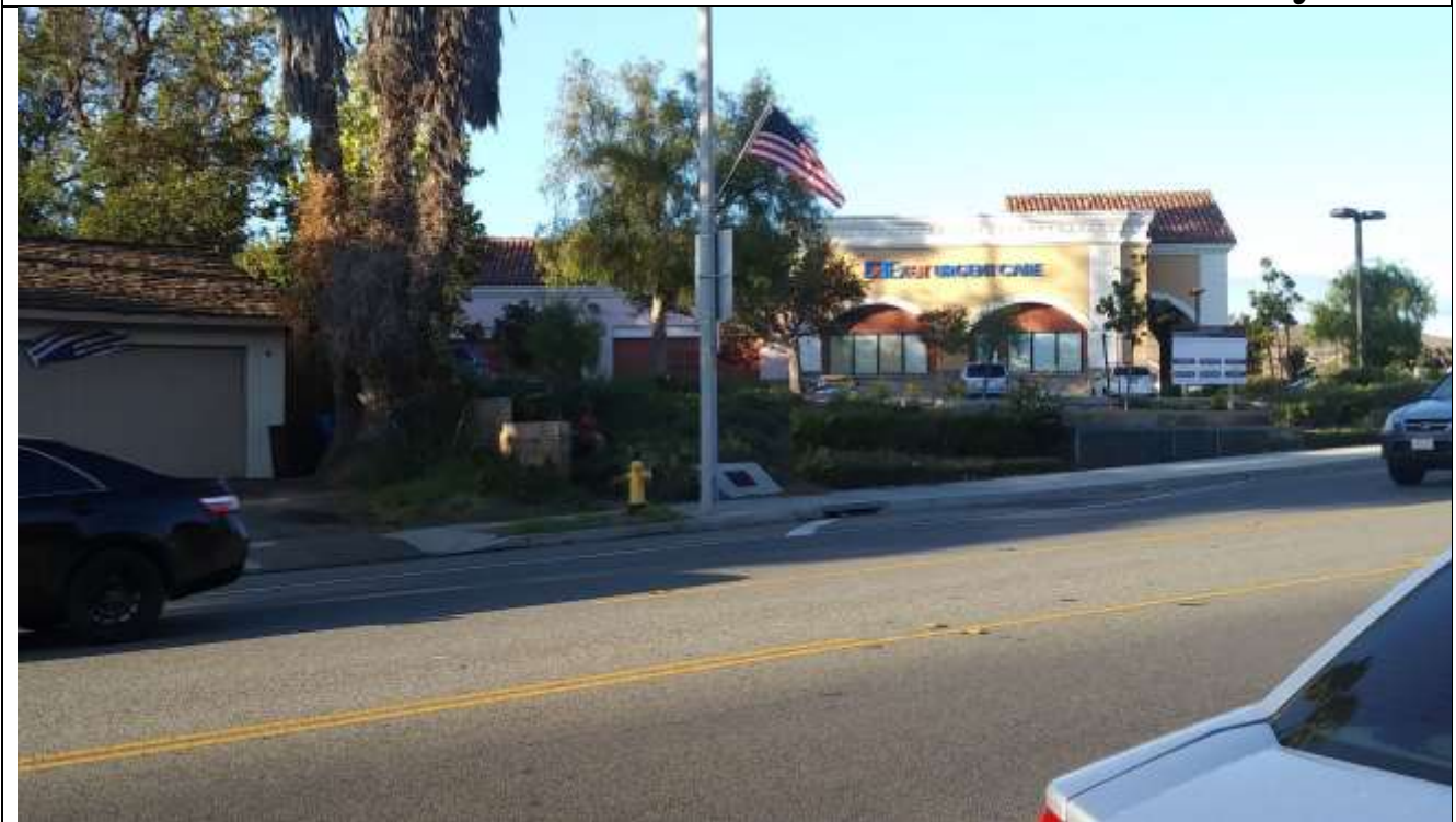
Shopping center close to homes and narrowing of Wendy Drive