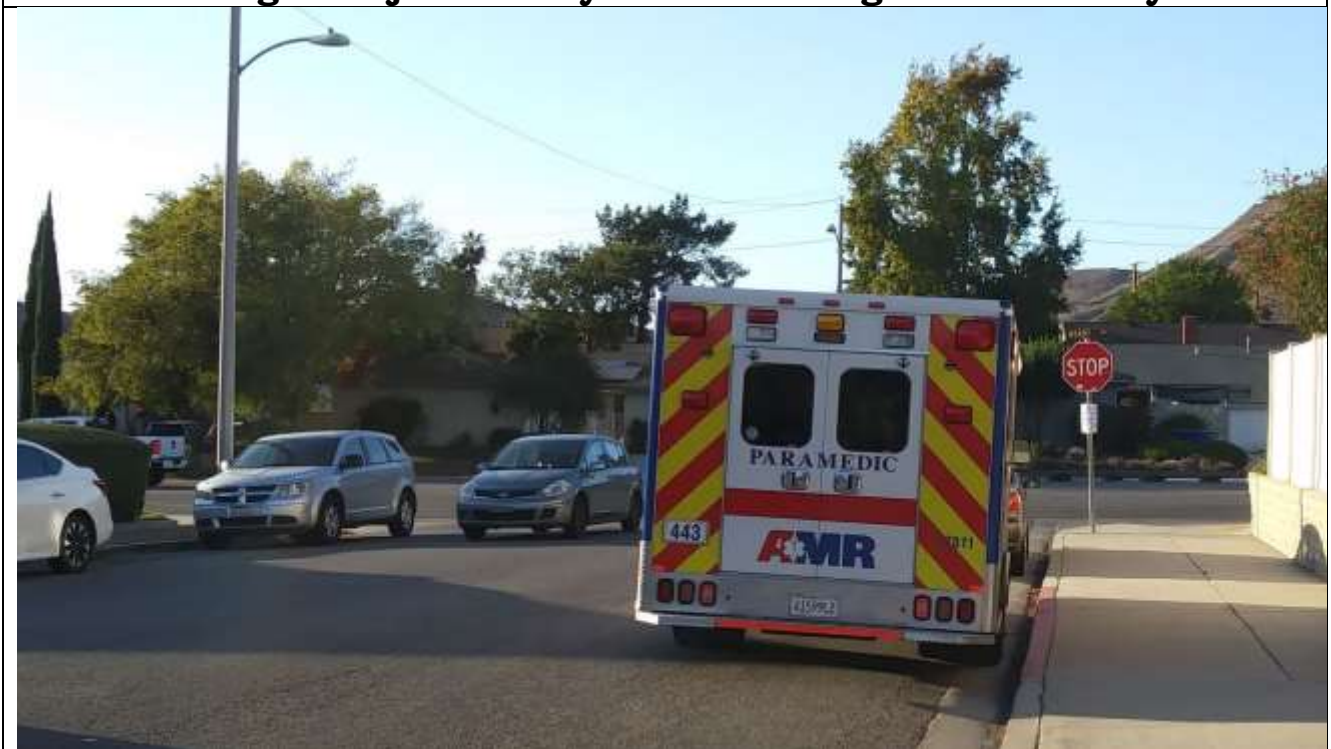
View from Bella to Wendy Drive, Casa Linda apartments to right