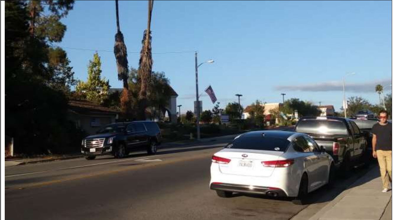
Left turn arrow and lane to turn onto Bella Dr. from Wendy Dr.