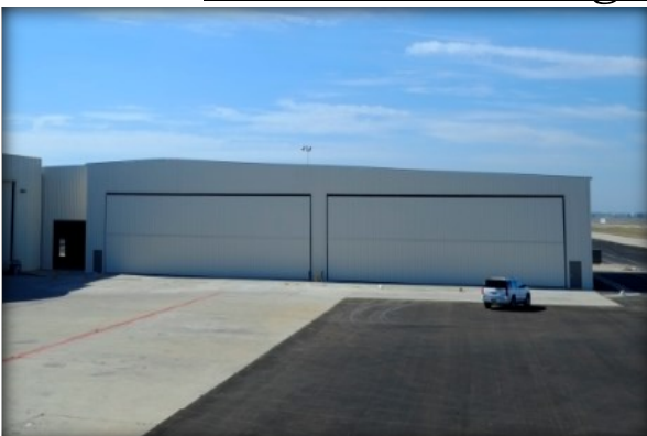
New CAF Hangar as of October 22, 2015

The CAF Southern California Wing, based at Camarillo Airport, announced a major expansion plan three years ago, and the first phase of development is taking shape on the west side of their facility. The overall structure is a 34,600 sq. ft. hangar with the south end slated for lease to the EAA. The CAF will utilize 25,100 sq. ft. for aircraft storage and static display. Each portion of the building will have independent restroom facilities.