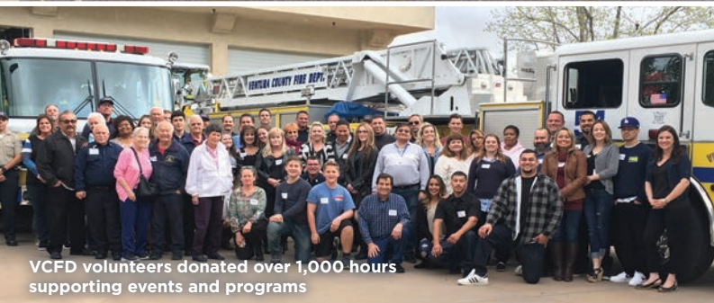
VCFD volunteers donated over 1,000 hours supporting events and programs