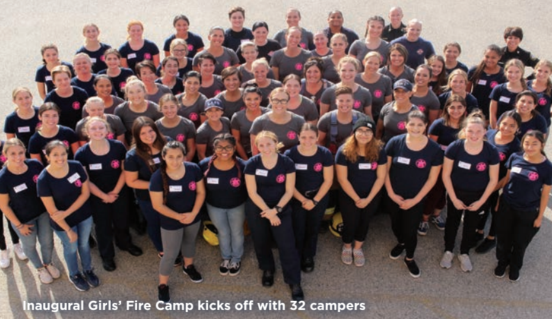
Inaugural Girls' Fire Camp kicks off with 32 campers