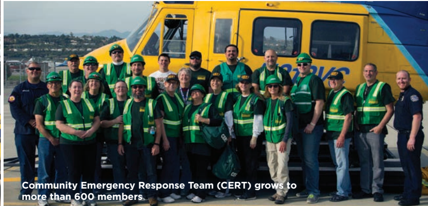
Community Emergency Response Team (CERT) grows to more than 600 members