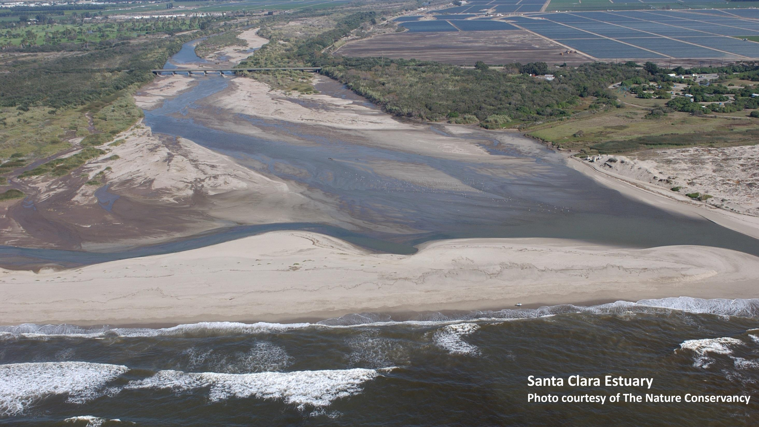
Santa Clara Estuary