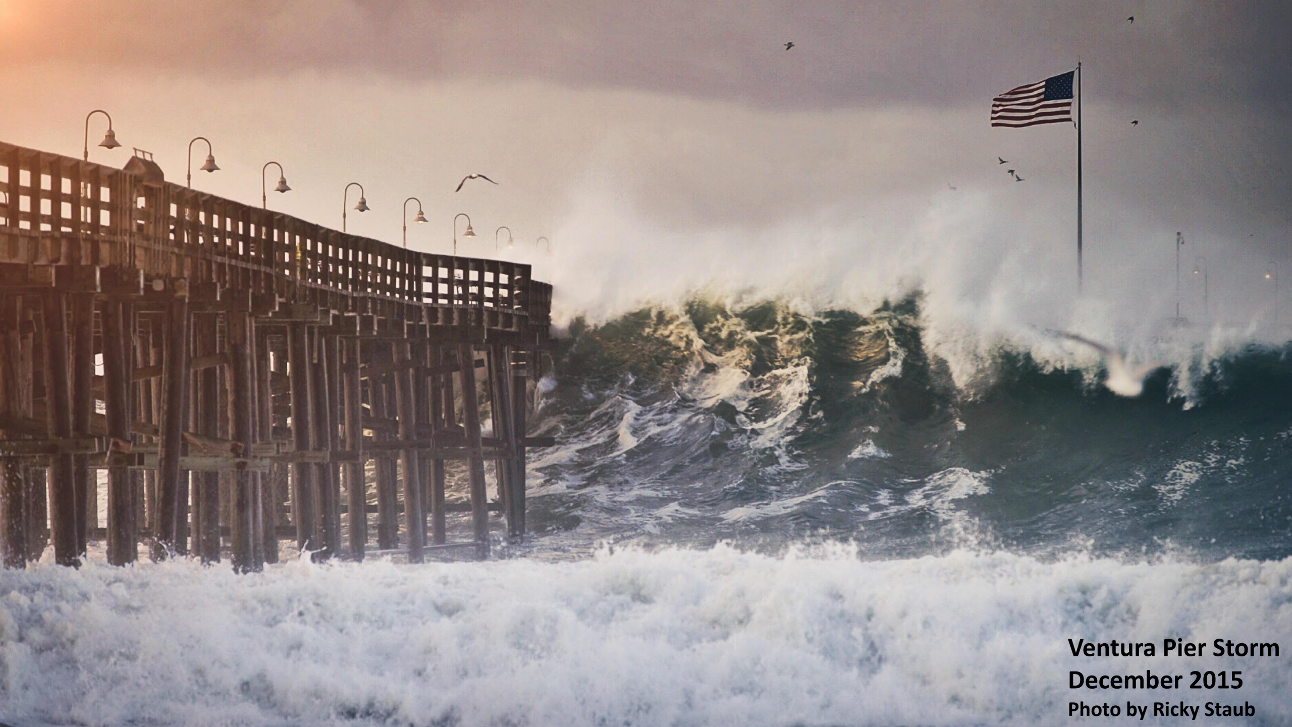
Ventura Pier Storm December 2015