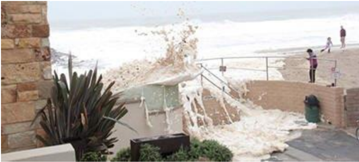
Pierpont Beach December 2015