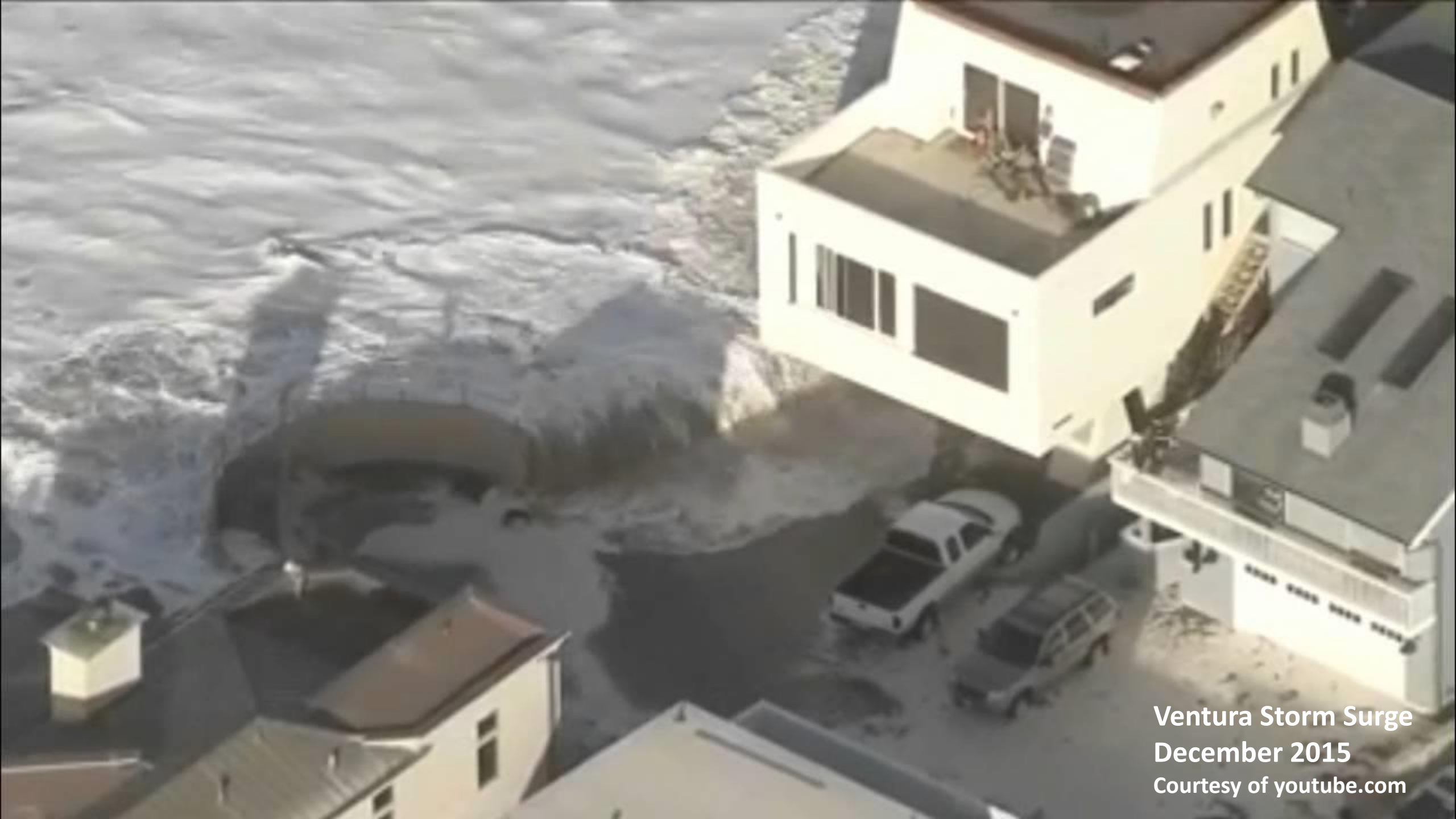
Ventura Storm Surge December 2015