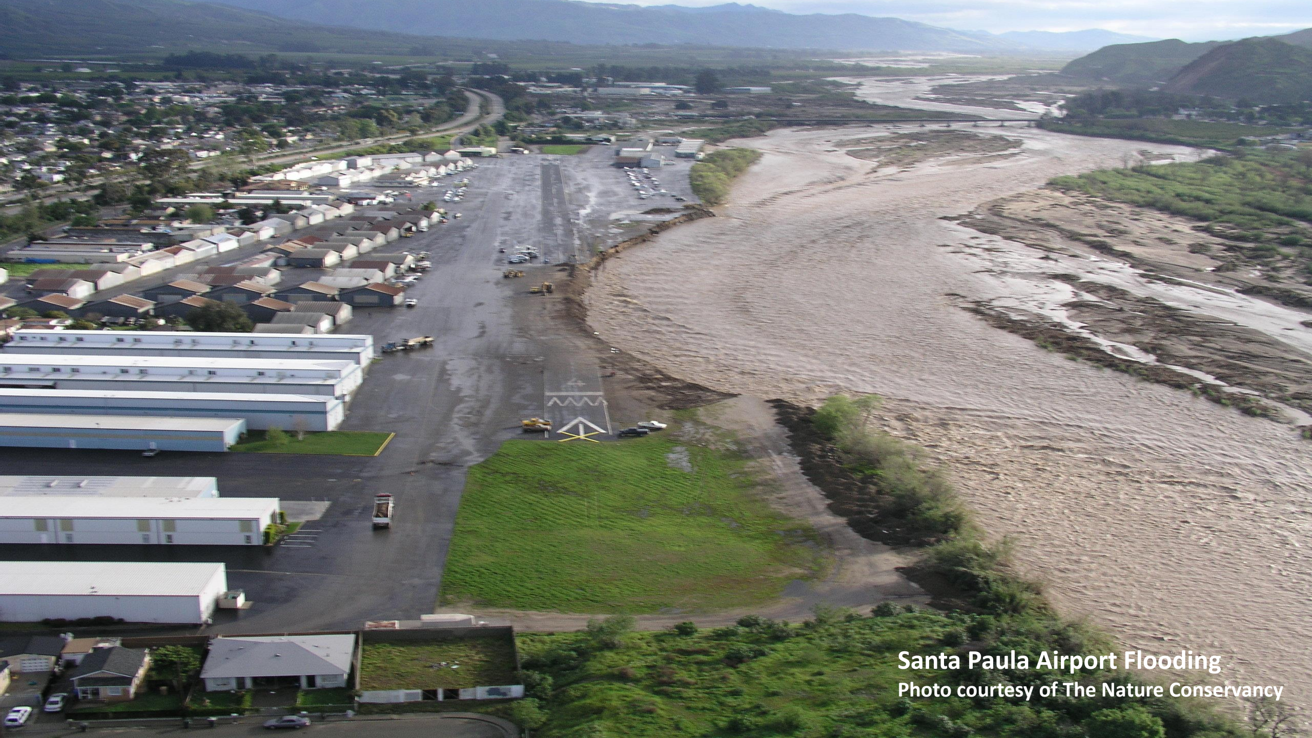
Santa Paula Airport Flooding