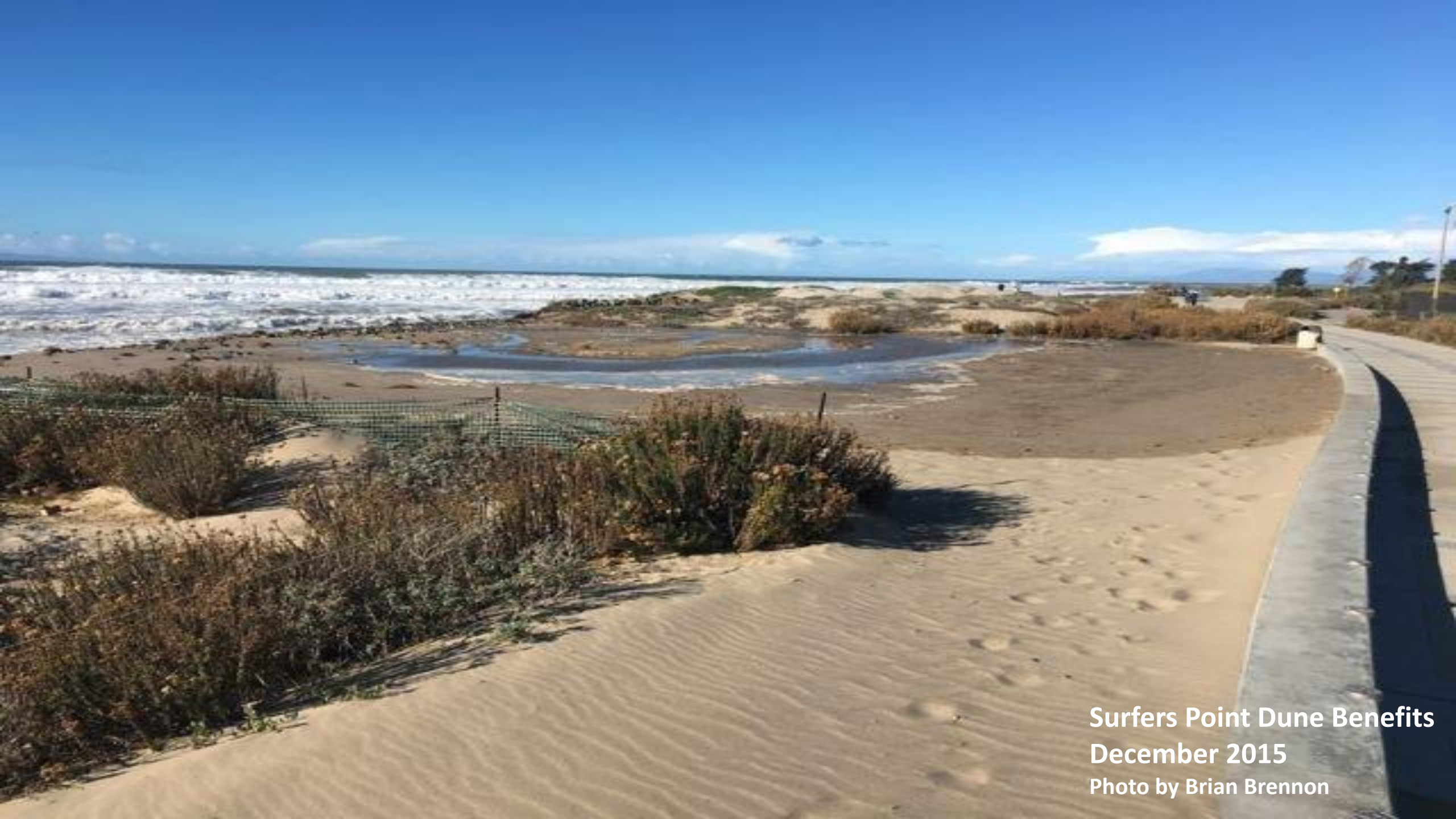
Surfers Point Dune Benefits December 2015