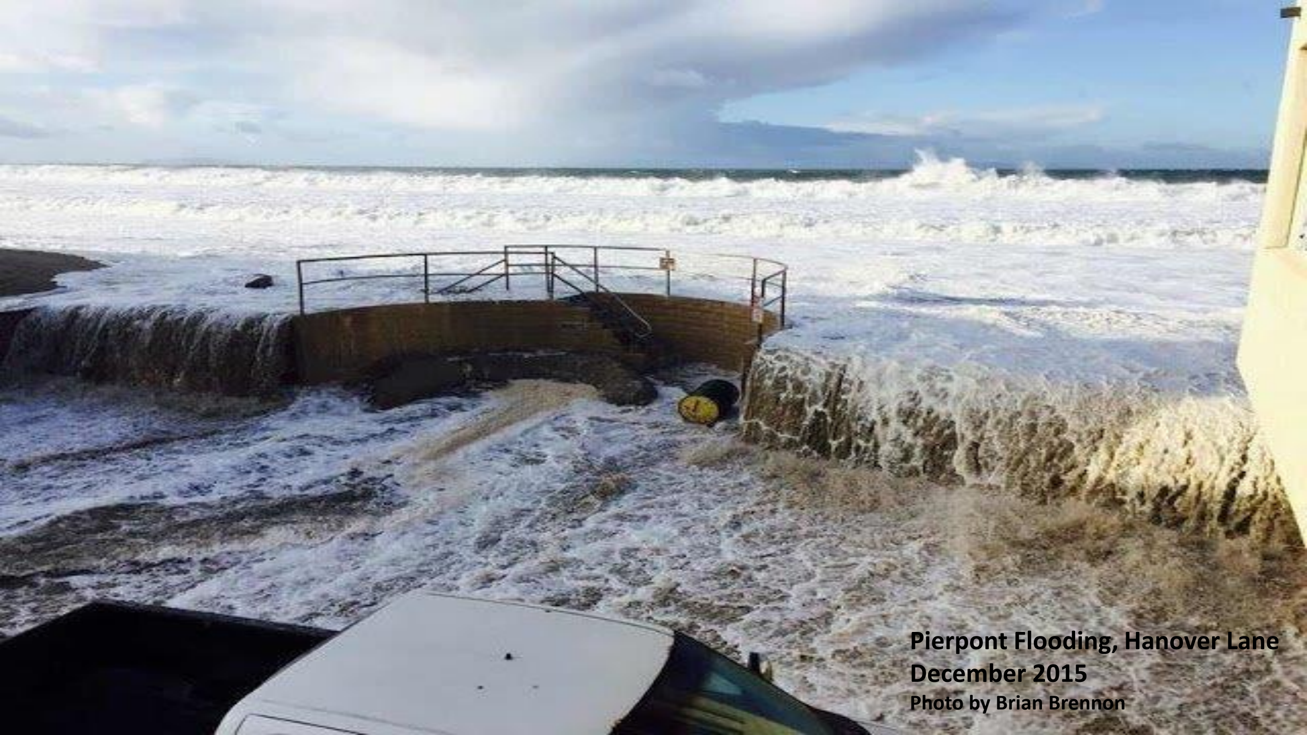
Pierpont Flooding, Hanover Lane December 2015