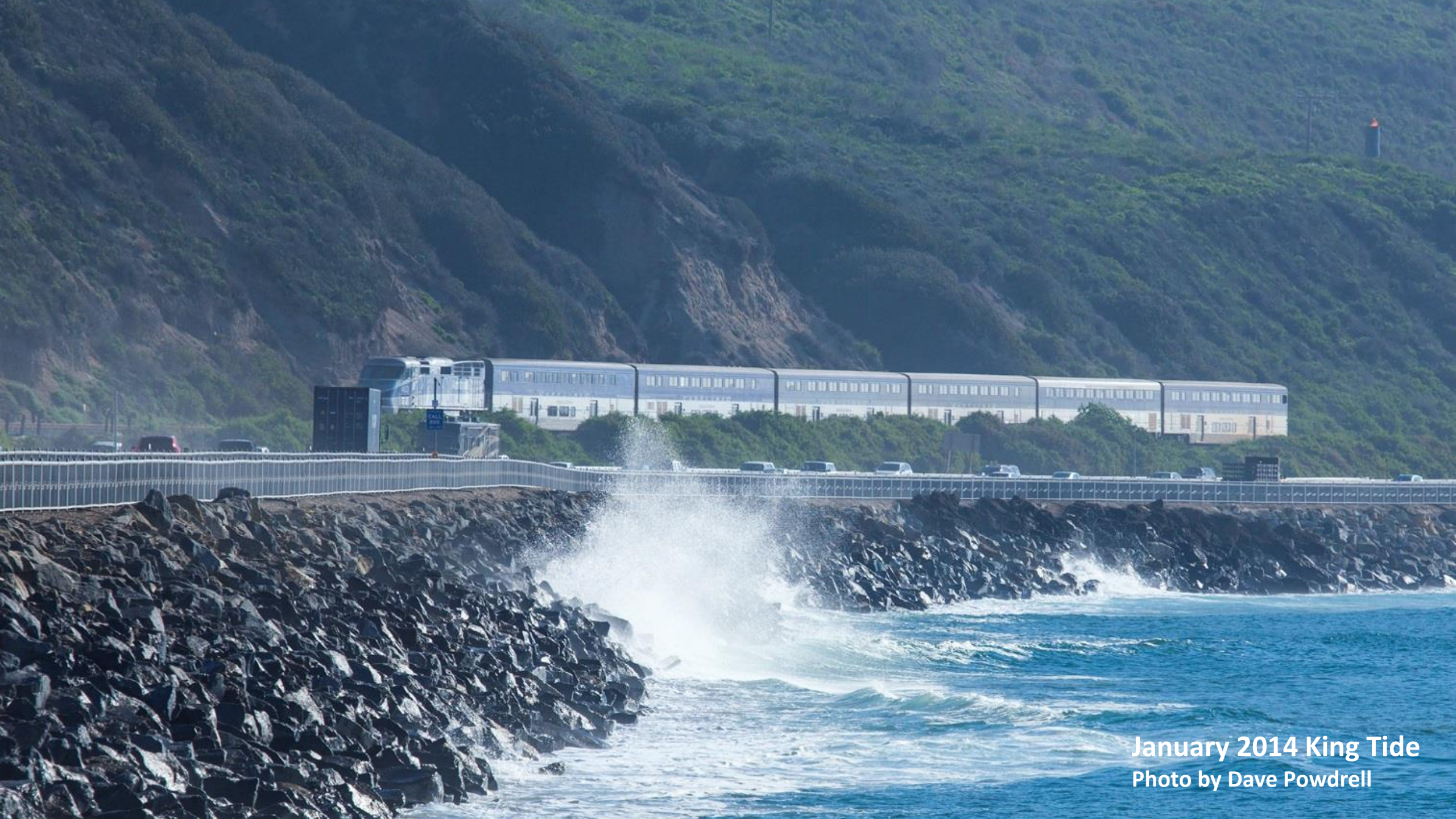
January 2014 King Tide