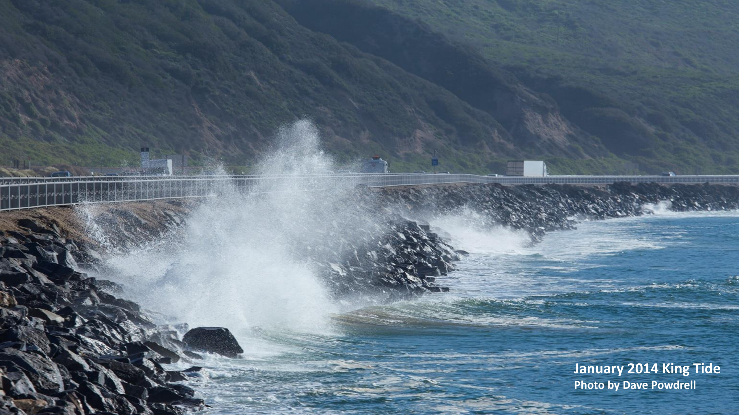
January 2014 King Tide