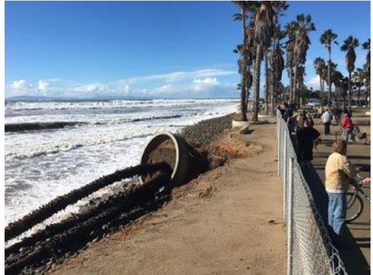
Surfer's Point Cobble Berm December 2015