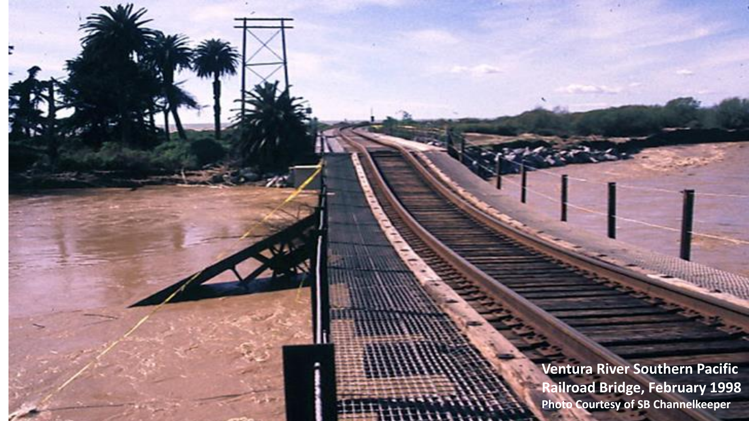
Ventura River Southern Pacific Railroad Bridge, February 1998