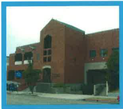
St. Barnabas Senior Center Los Angeles, CA

A few communities have built new facilities or made local investments but most centers are aging and lack important upgrades. A 2010 study revealed that: