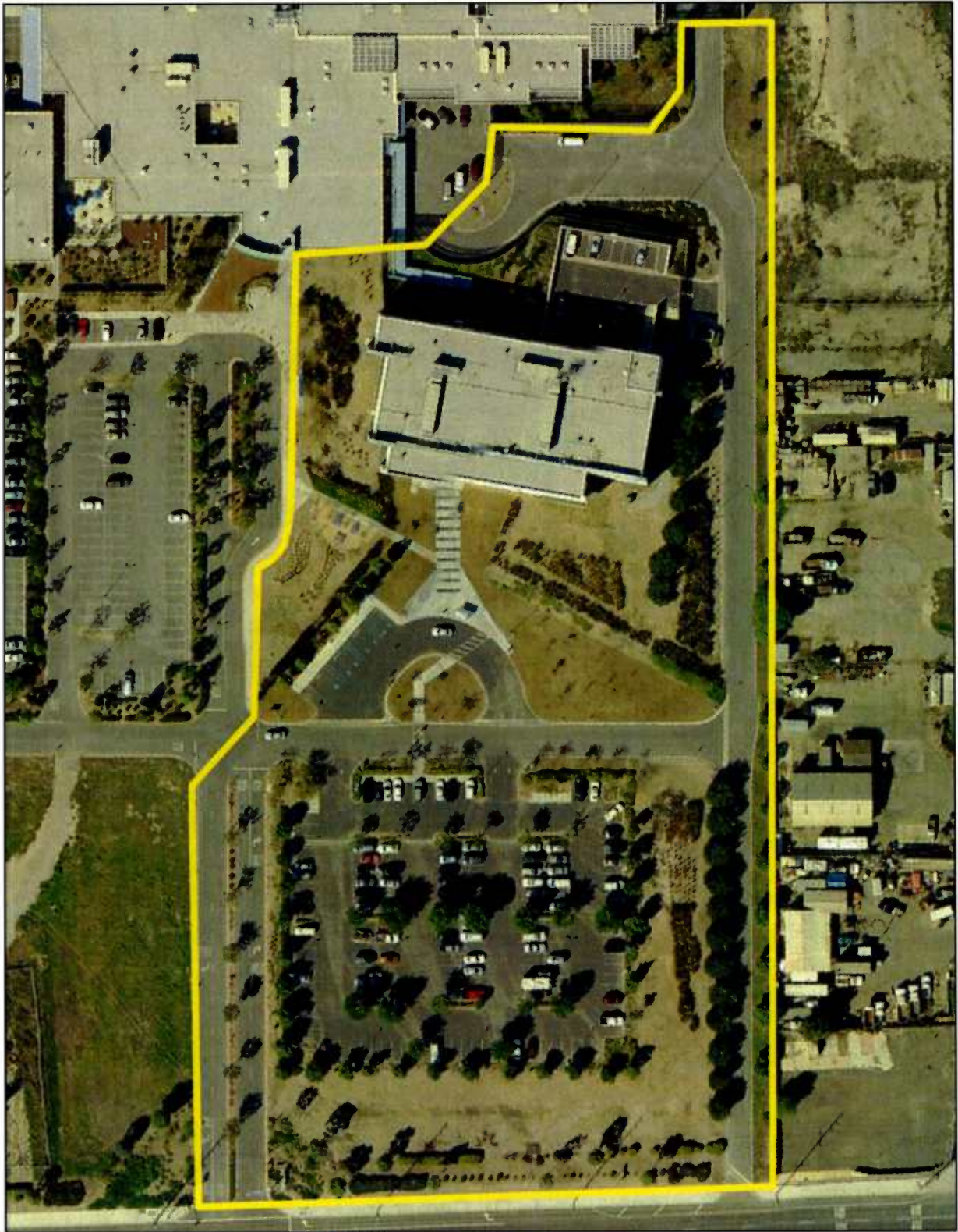
4353 Vineyard Ave. Oxnard