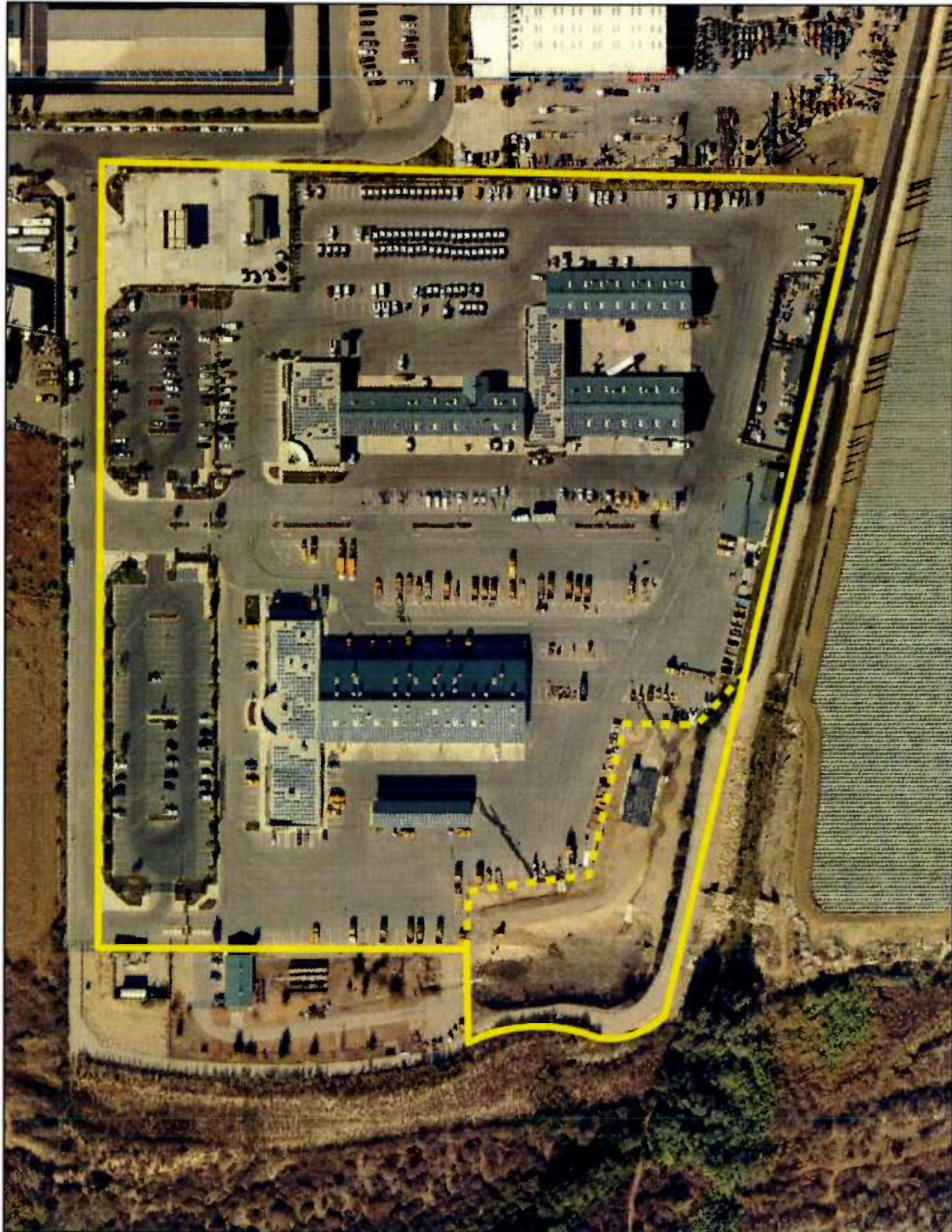
Saticoy Yard - 11201, 11251 Riverbank Dr. Ventura